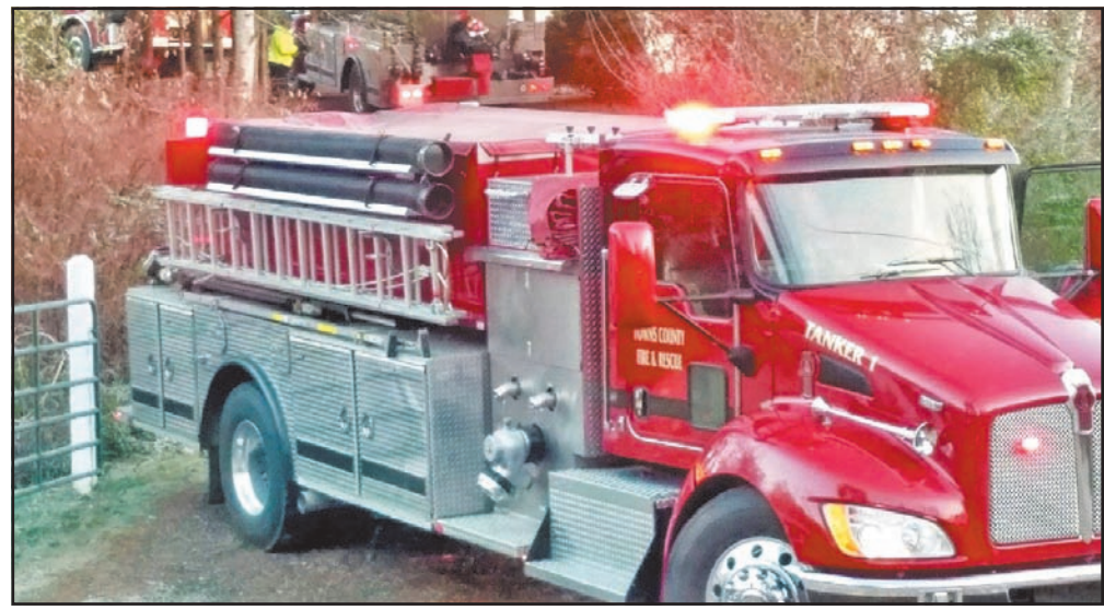
Towns County Fire Engine 1, Tanker 1 and Warne, North Carolina, line the driveway of a home on King Cove Road.

And just three days after the King Cove Road See Fire, Page 5A